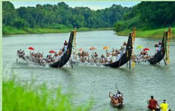
Thrissur's own Kandassankadavu Boat Race